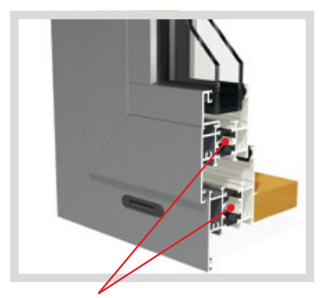
The 'thermal break' is made from polymide which reduces the transference of cold or heat through the frame.

With up to 73% improvement in thermal efficiency, you can enjoy the benefits of a drier, warmer home in winter, reduced heat in summer, and outstanding sound-proofing all year-round.